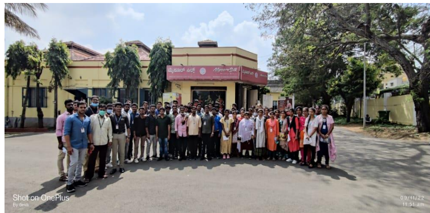
STUDENTS GATHERING AT KARNATAKA SILKS WEAVING FACTORY, MYSORE

In the Morning session, we visited Karnataka Silk Weaving factory at 10.30 am. We had a warm welcome by the company representative. They explained the silk manufacturing process to the students. The HR manager of Karnataka silks company explained their HR policies and marketing methods of selling Karnataka silk sarees and their financial turn over etc. He also explained about their customers and their competitors. Then the company representatives took the students to the company visit to show their manufacturing process and equipments which they use for making sarees.